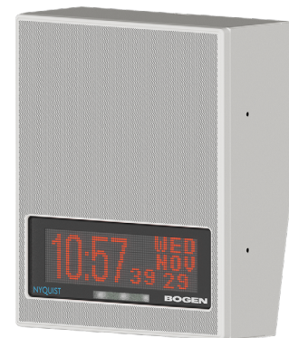
NQ-S1810WBC - Nyquist VoIP Wall Baffle Combo Speaker