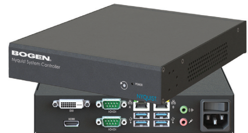
NQ-SYSCTRL - NYQUIST System Controller